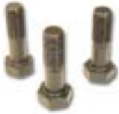
Product Model:Structural bolts