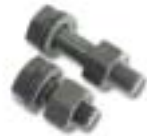
Product Model:Structural bolts

Product Name: heavy hex structural bolt-01